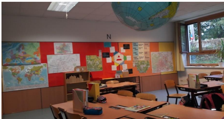
One of the class room

On the last day at 11:00 we checked out from the apartment and used our remaining time at the Department of Education until 18:00 to meet with Elvira. We can't forget her support and hospitality. In the evening we went back to Ethiopia.