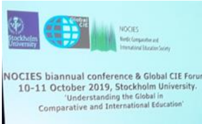
Banner of NOCIES conference