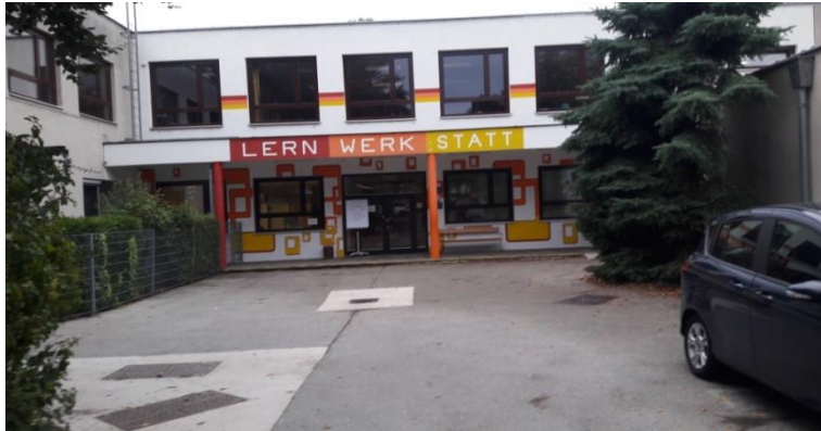
The school we visited

teaching and learning process, different supportive rooms and students in and outside the class rooms. It was a good opportunity for us and we gained useful experiences.